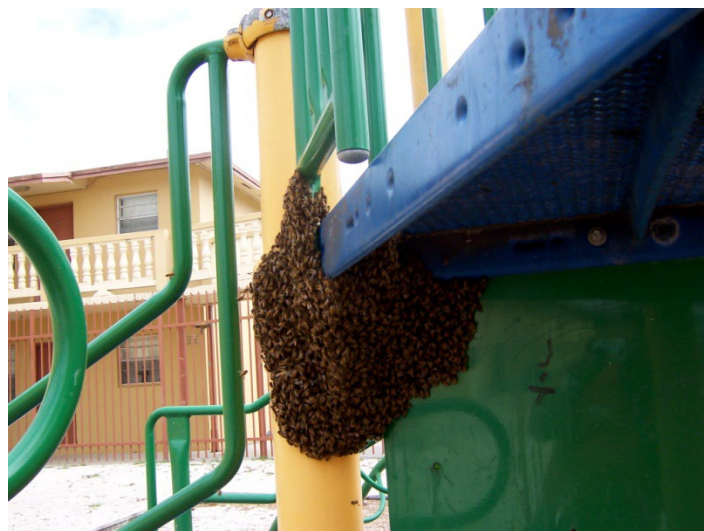
Figure 1. A swarm of bees has clustered on playground equipment.

Good colony management includes swarm prevention. Proactive beekeeping practices to alter colonies in response to potential swarming behavior must be undertaken regularly during the swarm season. Good management maintains strong colonies and allows for greater honey production and the potential to split and increase the total number of the beekeeper's colonies, all of which makes beekeeping much more profitable for hive owners.