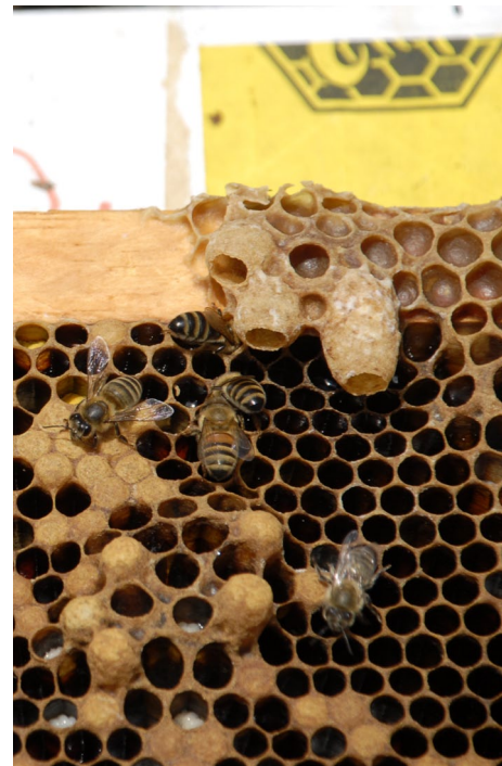
Figure 2. This photo shows two queen cups (no developing larvae present) left-of-center and a growing queen cell (containing a developing larvae) right-of-center.

old queen out as they go. The old queen takes flight, lands on a nearby structure (tree branch, fence post, etc.), and the worker bees circling around her land on her, forming a cluster typically ranging in size from a softball to considerably larger than a basketball. The cluster remains at this location, sending scout bees out to find a suitable cavity in which to build a nest. Once such a cavity is found (a process that can take minutes or up to 4 days), the entire cluster flies to the site in one circling mass. Swarming is reproduction at the colony level and is one of the honey bee colony's most fundamental goals, thus making it hard for beekeepers to control. The original, "parent" hive is left with about 30–50% of the original bee population, all of the brood, and multiple queens developing in their respective cells. Occasionally, the first virgin queen to emerge will also be a part of a swarm. Such swarms are called secondary swarms, with subsequent swarms being called tertiary and so on.