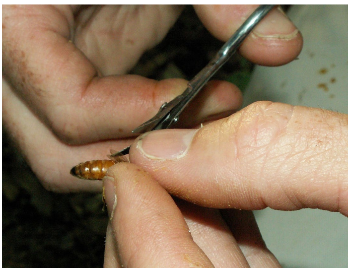
Figure 9. Take a small pair of scissors and cut off ½ of the forewing (the large, front wing) on one side of the queen's body. Credits: Amanda Ellis