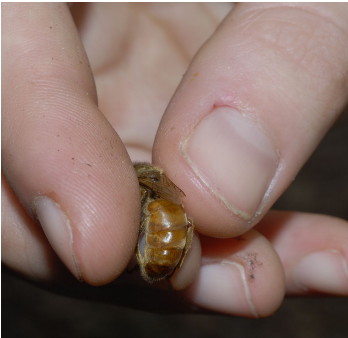
Figure 7. A healthy queen with her wings clipped to prevent her from leaving the colony with the swarm.

Clipping a queen's wing is a good way to minimize swarming tendencies in colonies (Figure 7). Since it usually is the old queen who leaves the colony with the swarm, clipping a queen's wing keeps her from being able to leave with the swarm. To clip a queen's wing, hold the queen between the thumb and pointer finger as seen in Figure 8. Take a small pair of scissors and cut off ½ of the forewing (the large, front wing) on one side of the queen's body (Figures 8 and 9). A clipped queen will try to leave the colony with a swarm, but she will not be able to fly away with it, and the swarm will return to the nest. Frustrated swarms (those that cannot "coerce" their queen to swarm because she is clipped) often kill their queen in an attempt to rear one that can fly. So, clipping a queen's wing is more of a safety net than a method of reducing the swarming tendency. This technique is most effective in controlling swarms when other swarm control methods are practiced at the same time. Worth noting is that a clipped queen sometimes will be unable to reenter the colony after a failed swarm attempt. In this instance, she will climb up a nearby bush or under the colony where the swarming bees will cluster around her. These swarms are easy to capture and can then be housed in a new hive. One should not try to reintroduce the swarm back into the parent colony. Once a colony tries to swarm, it will continue to do so.