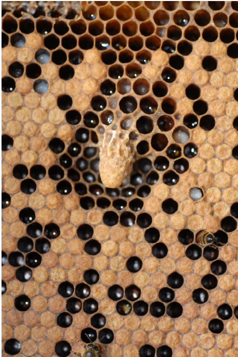
Figure 3. A capped queen cell.

being fed actively (figure 4). Once the cells are capped, it is difficult to stop the instinctual swarming behavior.