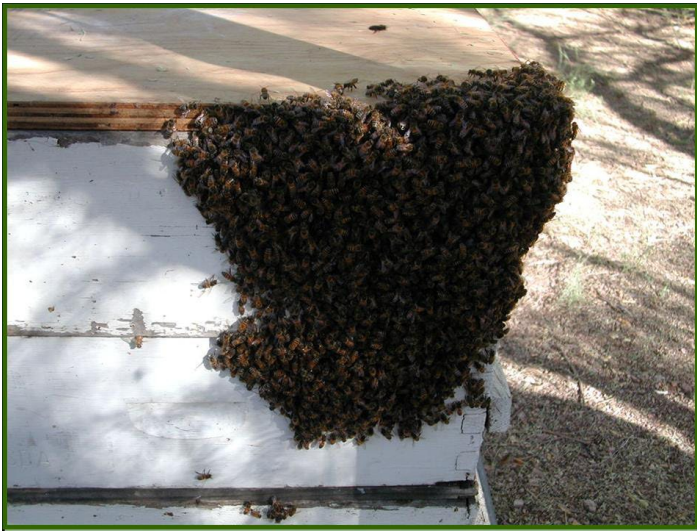
Figure 6. Usurpation of a European honey bee colony by an African honey bee swarm.

Africanized honey bees have been known to swarm long after the swarm season for European honey bees has ended. Africanized honey bees also swarm more frequently than European honey bees, and their swarms are typically smaller. Africanized swarms are docile like European swarms, with the defensive characteristics manifesting only after a colony establishes a nest, builds comb, and the population begins to grow. However, it is possible for an Africanized swarm to take over a European honey bee colony (called usurpation), replacing its queen with the Africanized queen (Figure 6). The Florida Department of Agriculture and Consumer Services recommends that beekeepers requeen managed honey bee colonies that are headed by suspicious queens with European honey bee queens purchased from reputable sources. For more information on Africanized bees, see: http://edis.ifas.ufl.edu/in790 .