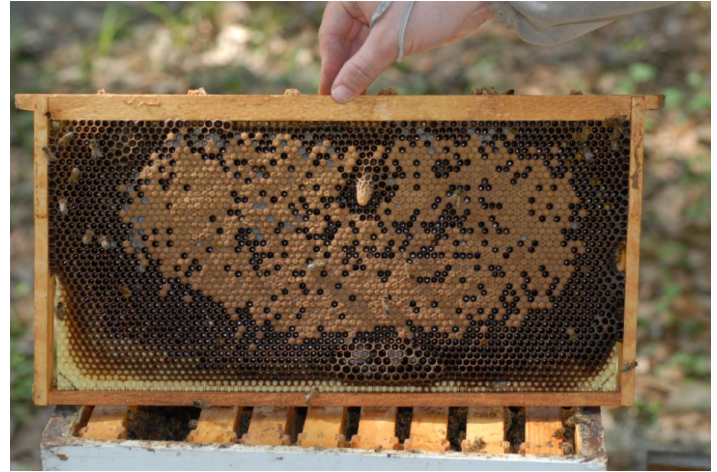
Figure 5. A queen cell within the brood pattern or on the outer edge of the brood pattern is normally, though not always, a sign of queen supersedure.

a day old) worker larva, the resulting queen likely will be inferior. Because of this, workers typically make supersedure cells at the perimeter of the brood pattern, because this is where the youngest worker larvae typically reside (Figure 5). As with everything in nature, there are always exceptions and you may find supersedure cells along the edge of the frame (or normal queen cells within the brood pattern).