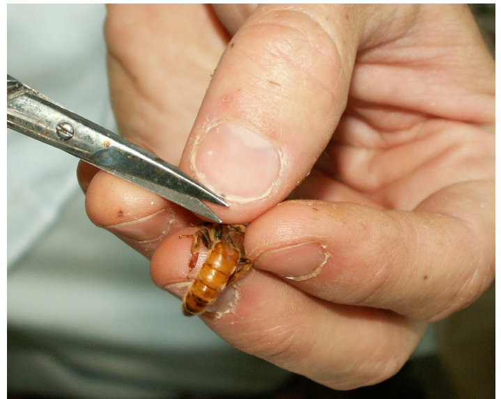
Figure 8. The proper position in which to hold a queen to facilitate wing clipping.

Proper spring management practices can help to prevent swarms. It is important to be able to recognize the signs of swarm preparation in the colony. Once queen cells are capped, it is nearly impossible to stop the bees from trying to swarm. Swarm prevention should already be underway about four weeks before the anticipated primary nectar flow begins. Use combinations of the following swarm control measures to limit swarming behavior by colonies.